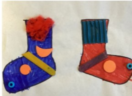
Key Stage 1 - Cain